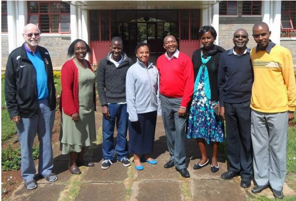
The National Exco Team during their Meeting in November 2017 at the Carmelite Community